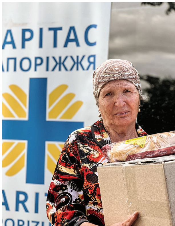
Caritas Zaporizhzhia delivers food kits and fresh bread to the residents of villages close to the combat zone.