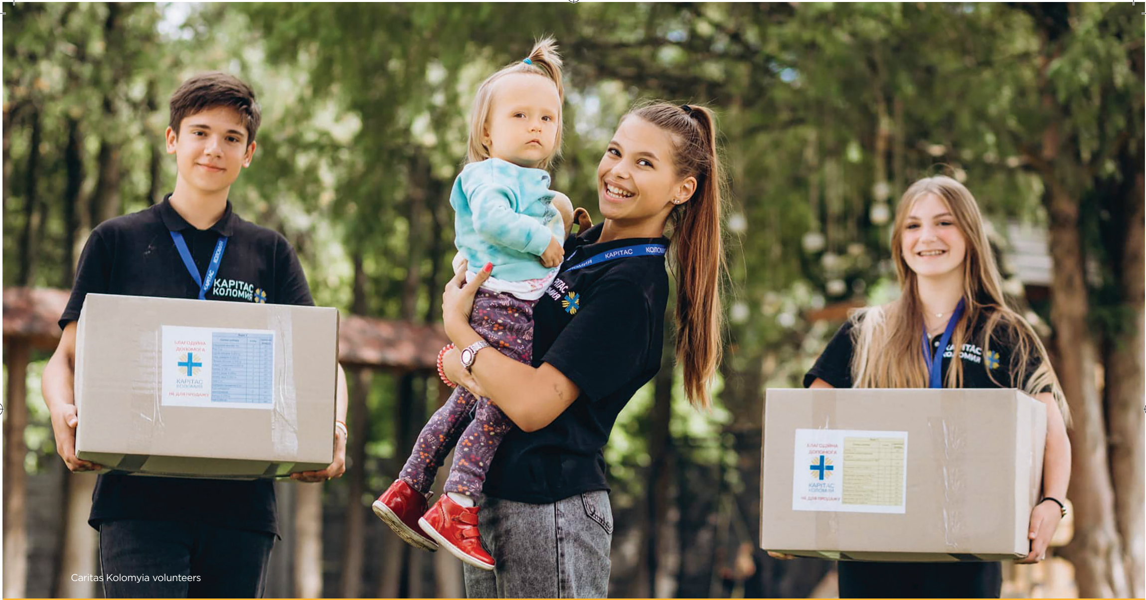
Caritas Kolomyia volunteers