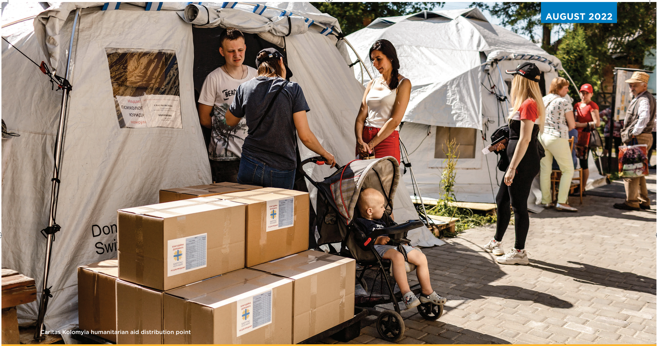
Caritas Kolomyia humanitarian aid distribution point