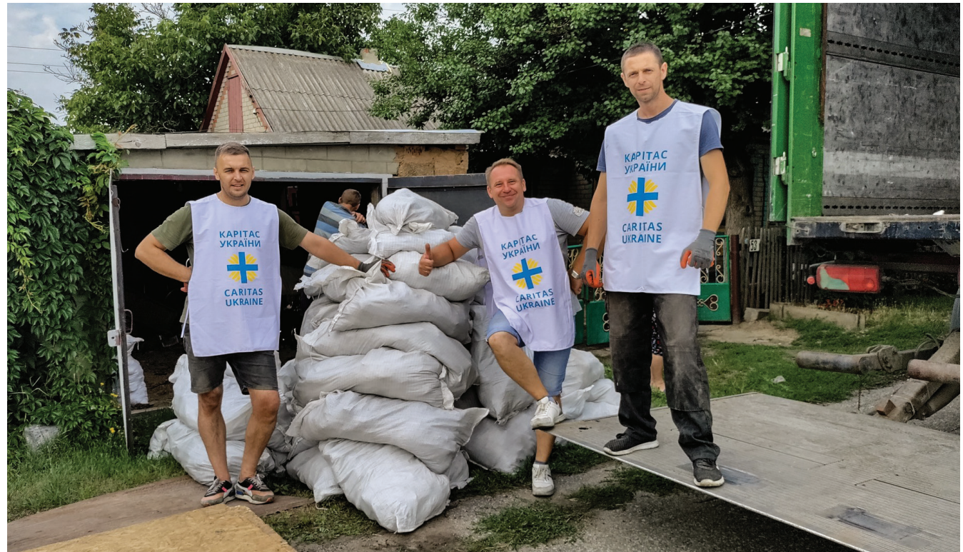
Workers of Caritas Zaporizhzhia brought winter heating supplies to the villages close to the combat zone. Those villages no longer have water, natural gas or electricity.

OF THE MOST VULNERABLE HAVE BEEN REACHED, INCLUDING WOMEN AND CHILDREN, SINGLE PARENTS, LARGE FAMILIES, ELDERLY PEOPLE AND PEOPLE WITH DISABILITIES.