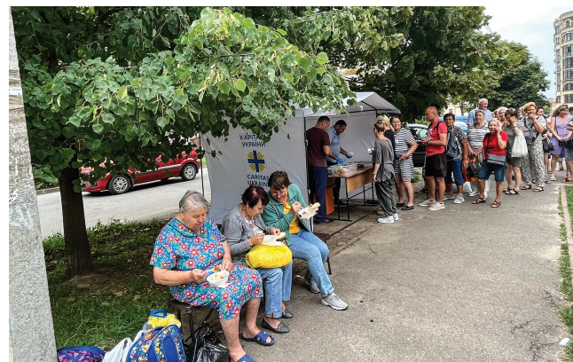
Caritas Poltava distributes hot meals.