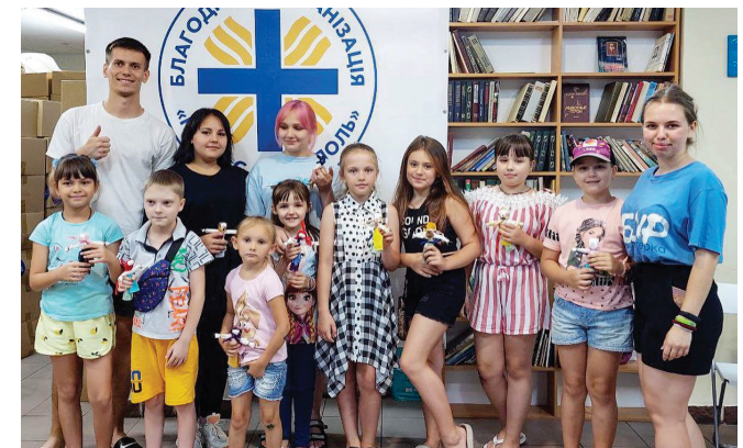
Caritas Mariupol Children's Center. IDP children hand-crafted the dolls themselves.