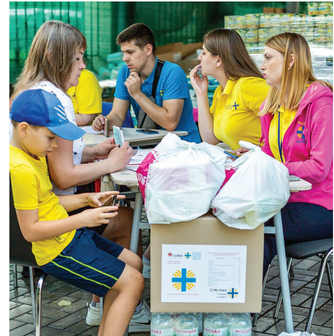
Caritas Donetsk humanitarian aid distribution point in Dnipro City. People who managed to flee the occupied territories get help here.

Caritas provides safe and dignified temporary housing for internally displaced people who plan to stay in their regions, as well as those who are on their way to the border to seek shelter in Europe.